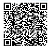
Data Sheet PAGUFIX