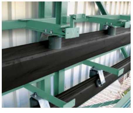
High-care transport thanks to enclosed belt design