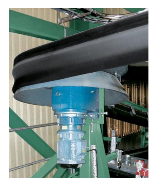
Good curve negotiability eliminates need for transfer points

This protects the material conveyed and the environment. Several feeding and discharging points can be set up along the transport route.