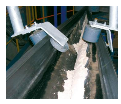
Simple loading of sensitive conveyor belts with open belt

** Use and suitability to specs on request